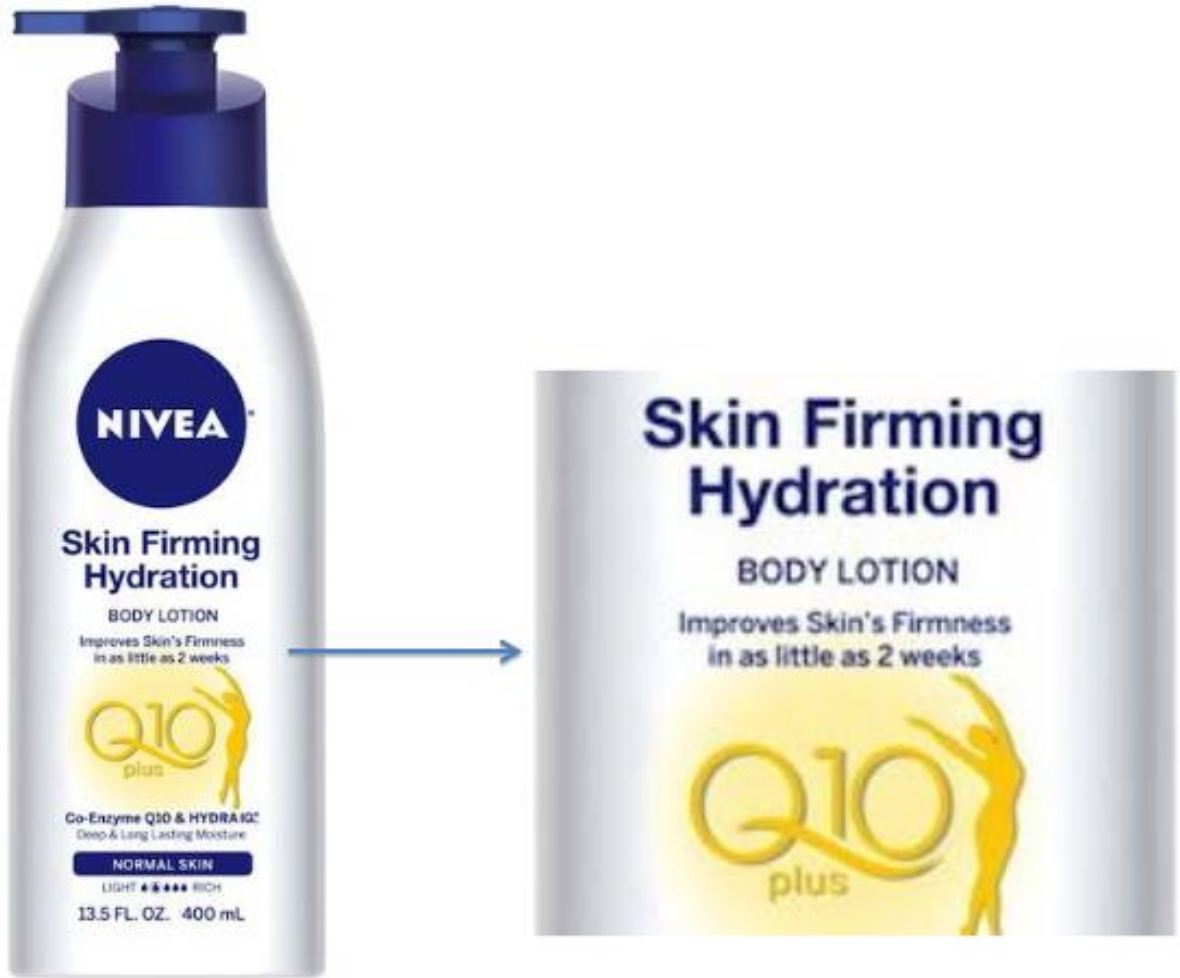
Figure 1 (SAC ¶ 9)

1 2 3 4 5 6 7 8 9 10 11 12 13 14 15 16 17 18 19 20 21 22 23 24 25 26 27 28