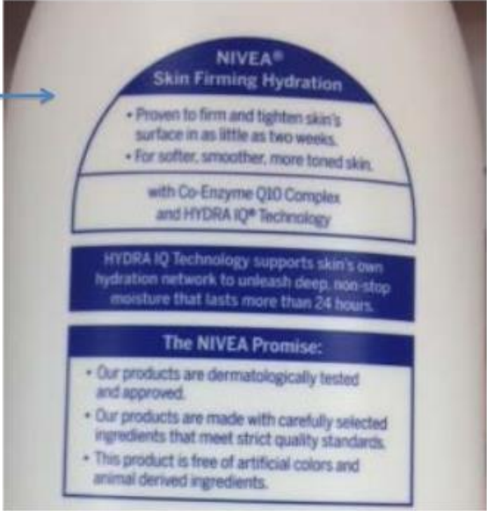
Figure 2 (SAC ¶ 10)